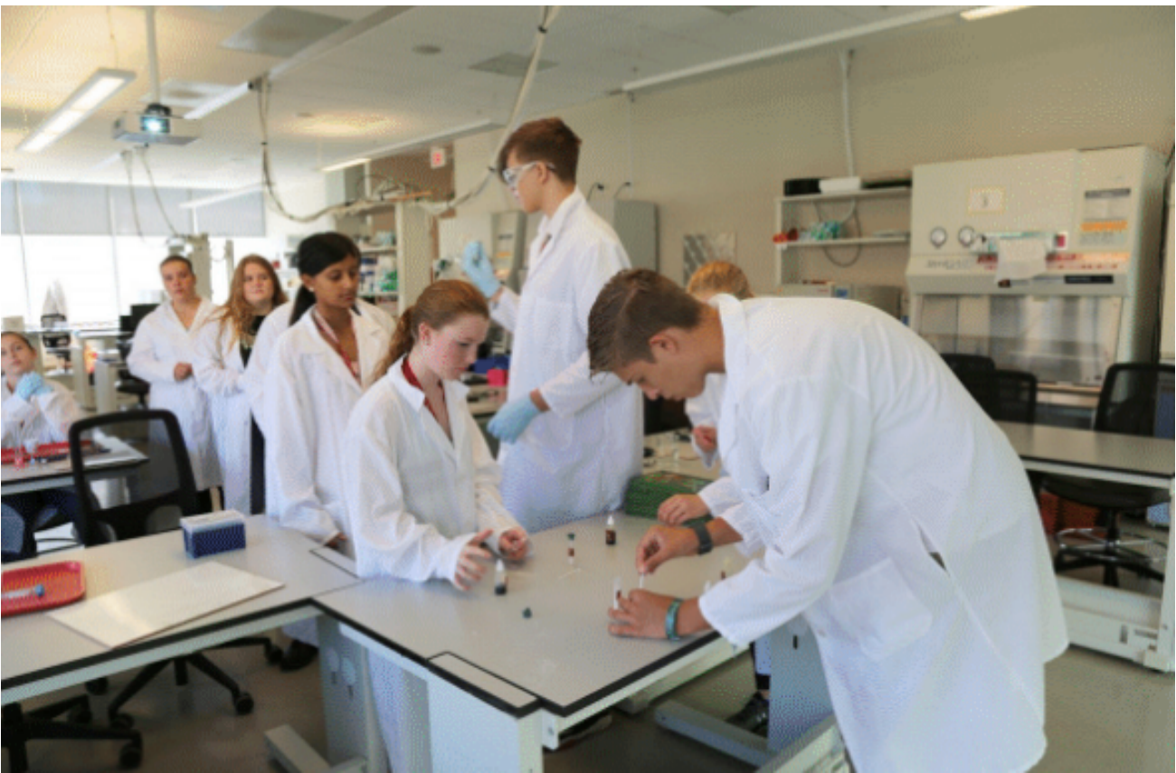
Above- The WROF Summer Science Scholars at UW-Madison

"Receiving a WROF scholarship has helped me continue on with my goal of becoming a registered nurse. The education at Edgewood has been worth it because the small class sizes make it easy to collaborate with other students and professors. Having hospital clinicals in Madison has made a huge impact because of the variety of patients that I am able to take care of. The financial generosity of WROF brings me a step closer towards my goal of caring for others in the community."