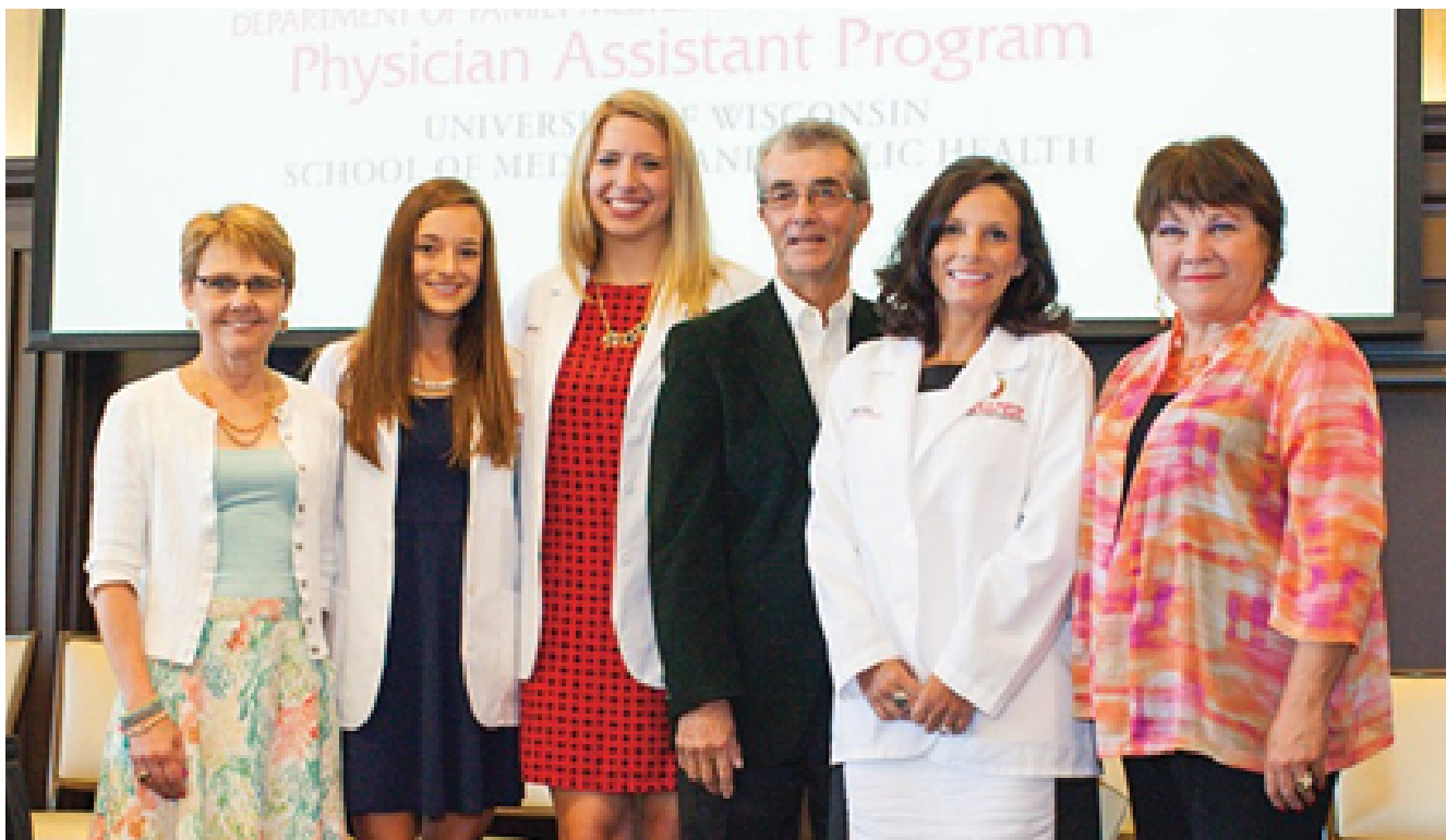
Left- WROF Physicians Assistants get their White Coats!

"Today I work as a marketing and project coordinator for the Biotechnology and Bioengineering Center at the Medical College of Wisconsin in Milwaukee. In addition, I am a freelance writer specializing in agricultural and environmental stories. I very much appreciate the opportunities support from WROF provided me. Thank you!"